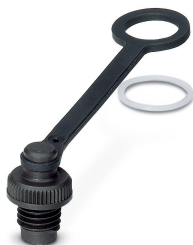
M8 sealing cap made of plastic with fixing band, for free M8 sockets, with 11.5 mm fastening eye

Please be informed that the data shown in this PDF Document is generated from our Online Catalog. Please find the complete data in the user's documentation. Our General Terms of Use for Downloads are valid ( http://phoenixcontact.com/download )