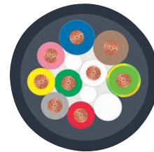
PUR/PVC black [PUR]