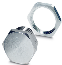
M16 screw plug for unused M12 housing cutouts

Please be informed that the data shown in this PDF Document is generated from our Online Catalog. Please find the complete data in the user's documentation. Our General Terms of Use for Downloads are valid ( http://phoenixcontact.com/download )