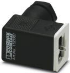
Valve connector, 3-pos., type C, unconnected, screw connection, cable screw connection Pg7

Please be informed that the data shown in this PDF Document is generated from our Online Catalog. Please find the complete data in the user's documentation. Our General Terms of Use for Downloads are valid ( http://download.phoenixcontact.com )