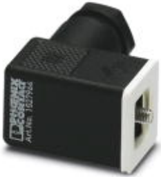
Valve connector, 3-pos., type CI, unconnected, screw connection, cable screw connection Pg7

Please be informed that the data shown in this PDF Document is generated from our Online Catalog. Please find the complete data in the user's documentation. Our General Terms of Use for Downloads are valid ( http://download.phoenixcontact.com )