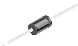
DO-35 Glass case COLOR BAND DENOTES CATHODE