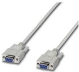
RS-232 cable, 9-pos. D-SUB female connector on 9-pos. D-SUB female connector, 9-wire, 1:1

Please be informed that the data shown in this PDF Document is generated from our Online Catalog. Please find the complete data in the user's documentation. Our General Terms of Use for Downloads are valid ( http://download.phoenixcontact.com )