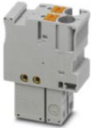
Plug, 2-pos. with integrated, automatic short circuit function

Please be informed that the data shown in this PDF Document is generated from our Online Catalog. Please find the complete data in the user's documentation. Our General Terms of Use for Downloads are valid ( http://download.phoenixcontact.com )