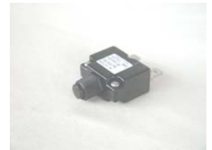
E198027 CITFUSE US