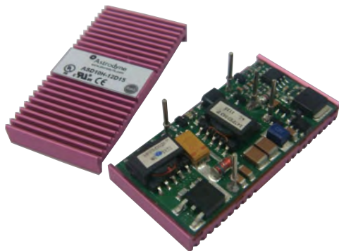
Unit measures 1"W x 2"L x 0.41"H