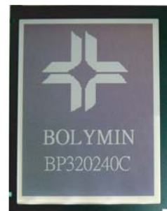
(Options : Frame without ears)