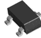
Package (SOT-23) Marking "CDA8"