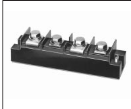
CM531213, CM531613 Dual SCR POW-R-BLOK™ Modules 130 Amperes/1200-1600 Volts