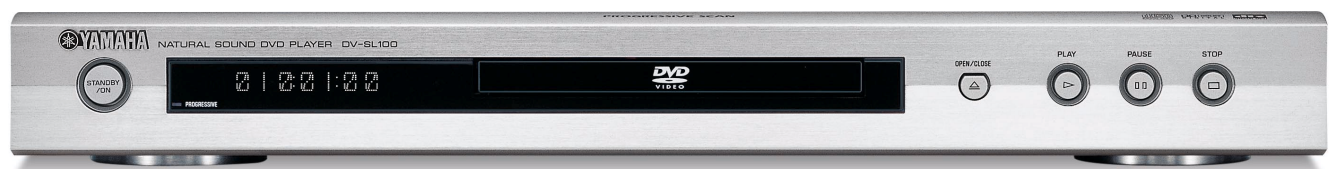
DV-SL100 Progressive Scan DVD Player

If you or anyone in your family enjoys making discs with MP3 files, you'll appreciate the DV-SL100. It provides full MP3 compatibility, including Fast Forward, Rewind and Special Playback functions, MP3 Navigation Display, playback of discs with both MP3 and JPEG files, and JPEG/MP3 Multisession compatibility