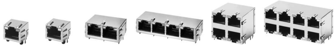
RJ Connectors, Side Entry with LEDs, Through Hole (THT)