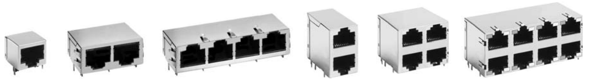
RJ Connectors, CAT. 5, Through Hole (THT)