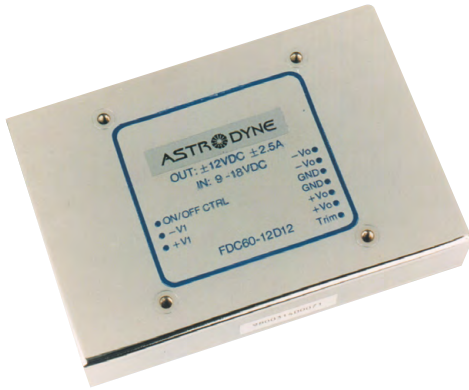
Unit measures 2.76"W x 3.94"L x 0.75"H