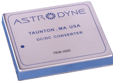
Unit measures 2.0"W x 2.0"L x 0.4"H