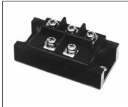
ME500810 Three-Phase Diode Bridge Modules 100 Amperes/800 Volts