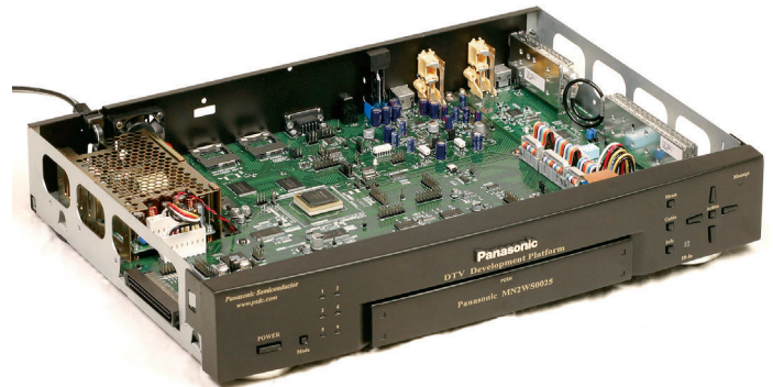
MN2WS0025 Reference System