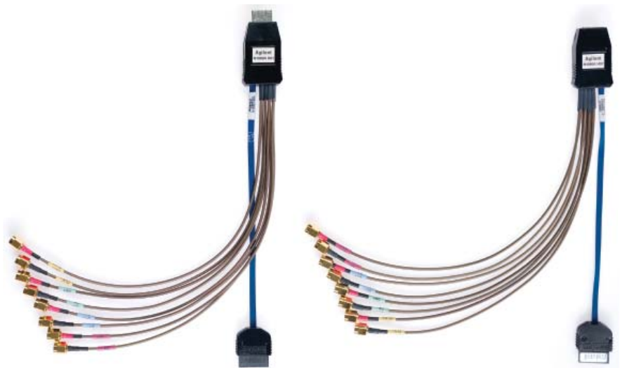
N1080A-H01 TPA with type A plug

Emerging consumer and entertainment equipment provides much higher resolution for user enjoyment. Higher resolutions demand higher communication rates, which place new demands on the source, sink and channel. The N1080A HDMI Test Point Access Adapters provide unrivaled convenience and performance.