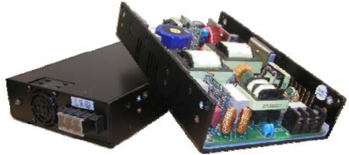
U Type: (U-Chassis): 8(L) x 5(W) x 1.6(H) inches. E Type: (Enclosed with built-in fan): 9(L) x 5(W) x 1.6(H) inches.