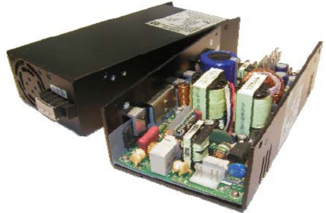
U Type: (U-Chassis): 8(L) x 4.33(W) x 2.5(H) inches E Type: (Enclosed with built-in Fan): 9.17(L) x 4.25(W) x 2.5(H) inches