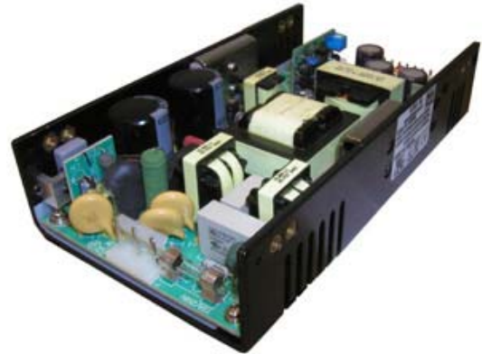
6.8(L) x 3.8(W) x 1.5(H) inches.