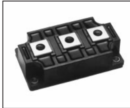
RM300CA-9W Fast Recovery Welder Diode Module 300 Amperes/450 Volts