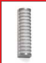
SLICE WALL/CEILING SL100/SL110 P. 202