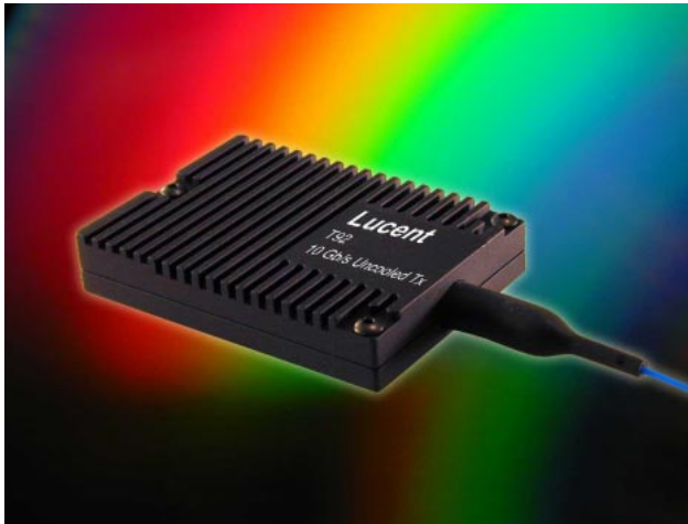
Offering SONET/SDH compatibility, the T92-Type Uncooled Laser Transmitter is manufactured in a 24-pin DIP assembly with a single-mode fiber pigtail.