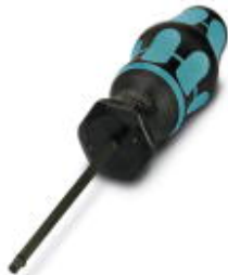
Torque screwdriver, with preset torque of 0.2 Nm and 4 mm hexagonal drive for M8 connectors

Please be informed that the data shown in this PDF Document is generated from our Online Catalog. Please find the complete data in the user's documentation. Our General Terms of Use for Downloads are valid ( http://download.phoenixcontact.com )