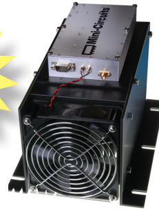
ZHL-30W-262-S+ Price: $1995.00 (QTY 1-9)